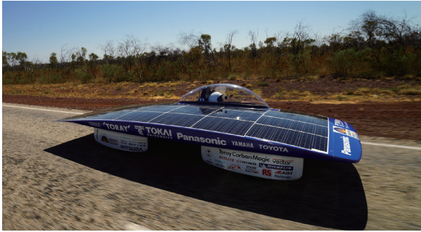
2013 Tokai Challenger places the second at the World Solar Challenge

SC/Tetra excels at accurate representation of geometry. Engineers can use the tool to conduct automotive aerodynamic analysis, or evaluate the performance of rotating machinery such as fans and turbines.