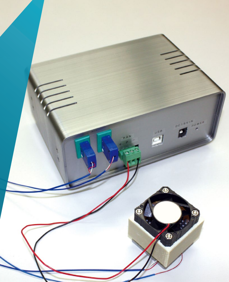
Figure 1 – Heat generation amount measurement system