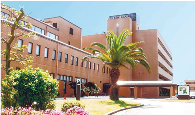
Nagoya Municipal Industrial Research Institute