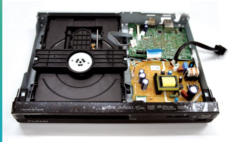
Figure 1: inside a DVD player

While Funai Electric's main reason for using thermal analysis software was to design electronic devices,