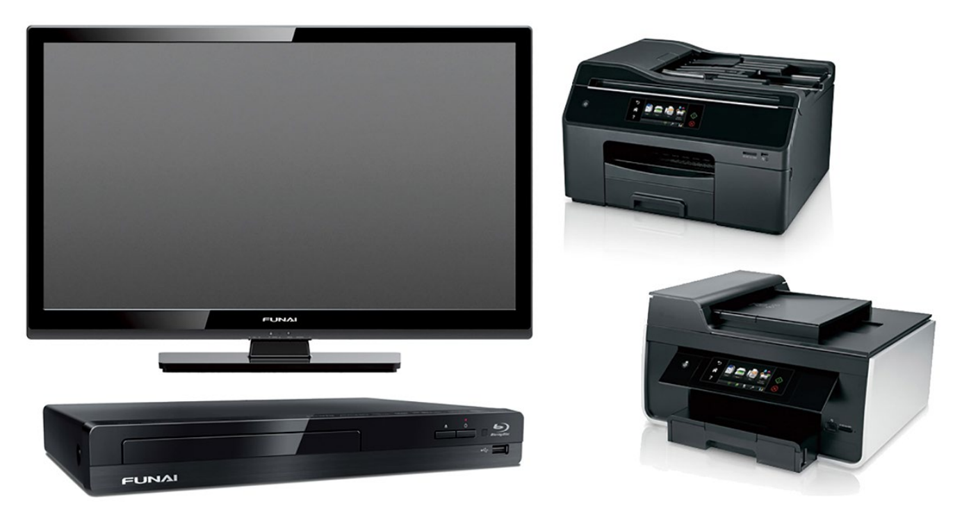
Main product range of Funai Electric

they decided to use SC/Tetra instead of HeatDesigner, a structured mesh thermal analysis software specially designed for electronics cooling. SC/Tetra enabled the Funai Electric engineers to create intricate, highly detailed models. Engineers could analyze their rotating disk drive products such as CD-RW and DVD drives for PC and video equipment. They were able to represent fans and blowers with a high degree of precision and perform the associated system analyses. After discussing software options with Cradle, Funai Electric decided that SC/Tetra provided the greatest amount of modeling flexibility.