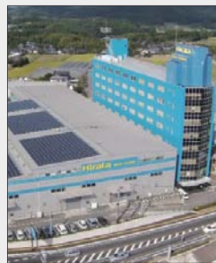
▲ Headquarters: Kumamoto plant